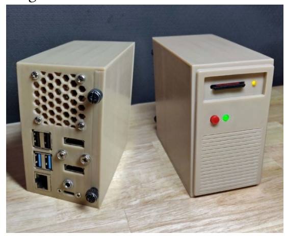
But it has a fan?