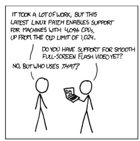
https://xkcd.com/619/ Reproduced with Permission

http://creativecommons.org/licenses/by-sa/ 2.5/ca/deed.en CA